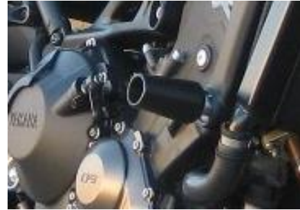
FZ-09 Frame Slider Kit